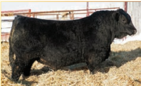
JPCC MONEY 174H | SERVICE SIRE

AI'd April 12, 2022 to JPCC Money 174H Exposed April 29, 2022 - June 4, 2022 to Scissors Hemisphere 2H