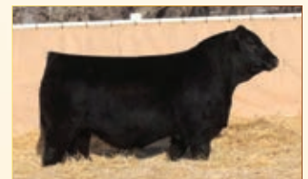
MONUMENT 28H | SERVICE SIRE

AI'd April 12, 2022 to Wheatland Monument 28H Exposed April 29, 2022 - June 4, 2022 to Scissors Hemisphere 2H