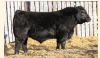
JPCC DESERT STORM 95J | SERVICE SIRE TO LOT 10 + 11

Exposed April 29, 2022 - June 4, 2022 to Scissors Hemisphere 2H