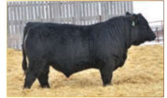
SCISSORS HEMISPHERE 2H | SERVICE SIRE

A baldy and Kill Switch daughter, this one should be staying here. Sara 109J will find many friends on December 4th. Safe to Monument for a mid January calf. Safe to AI