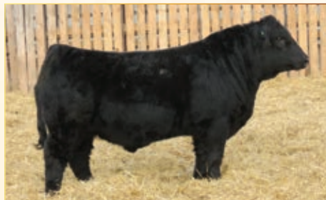
R PLUS 5015C | SERVICE SIRE