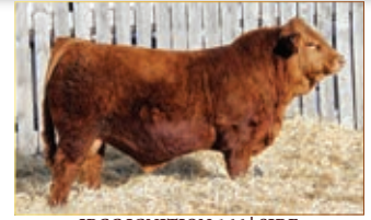
JPCC IGNITION 166 | SIRE

A moderate framed, attractive Ignition daughter. We are highly anticipating our first daughters of Ignition to calve, and if this girl is any indication of what to expect we can't wait. Watch for an exciting \frac{3}{4} blood calf out of our 2022 high-selling \frac{1}{2} Storm 95J. Safe to AI