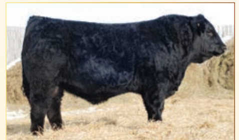
SPRINGCREEK LOTTO 52Y | MATERNAL GRANDSIRE