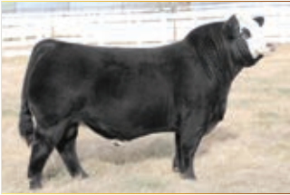
SRH HANNIBAL 5H | SERVICE SIRE

A real soggy made lower set heifer here with a little bit of white on her belly. 59J will be a super easy keeping female just like her dam with an awesome udder. She is AI bred to Hannibal, the black white face calving ease bull that Canadian Sires owns. Should make for an exciting calf.