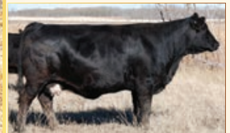
SPRINGCREEK MISTRESS 121Z | DAM to lots 32 & 33