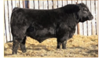
DESERT STORM 95J | SERVICE SIRE

Another 5015C daughter that has really impressed us. She is deep sided with lots of volume and a real feminine look. She is bred to the high-selling bull from JP's sale this spring JPCC Desert Storm 95J. A real free moving calving ease bull with some great cows backing him up. When we saw Desert Storm's dam this spring before the bull sale, that's what solidified our opinion about him as being our next heifer bull.