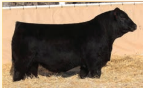
WHEATLAND MONUMENT 28H | SERVICE SIRE