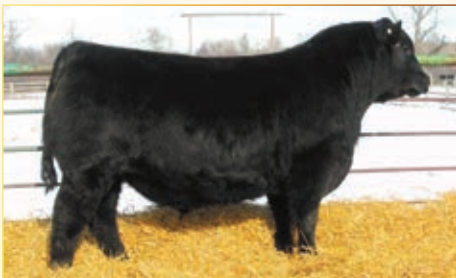
PEAK DOT PROFOUND 100J | SERVICE SIRE

A stylish 8100 daughter who stems back to Brooke and Stacy's good donor cow 29B. Foxy 228J wasn't slated for the sale but we were able to convince the kids otherwise at sale selection time. Vet called her 3 months at preg-checking time so expect an exciting 1/2 blood calf near the end of January out of our newest angus herdsire Peak Dot Profound 100J. Exposed April 29, 2022 - June 6, 2022 to Peak Dot Profound 100J