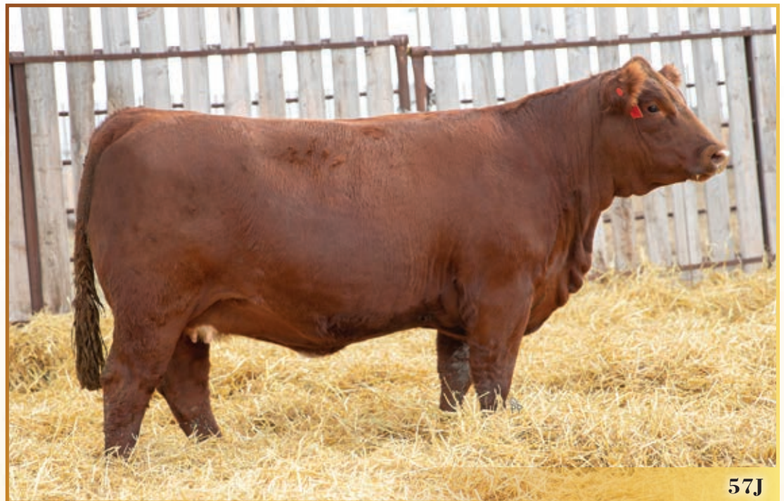
MRL RIP ZONE 42J | SERVICE SIRE to lots 12-16, 41-45