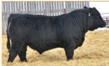
SCISSORS HEMISPHERE 2H | SERVICE SIRE