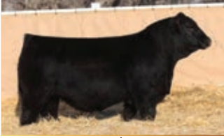
MONUMENT 28H | SERVICE SIRE

83J has brood cow written all over her. With Captain Morgan on the bottom side and Royal Flush on the top you have some elite Simmental breeding here. Safe to Monument which should result in a very exciting calf. Safe to AI