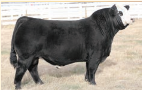
SRH HANNIBAL 5H | SERVICE SIRE

Exposed to MRL Rip Zone 42J April 21, 2022 – May 23, 2022. Ultrasound favorable to AI date.