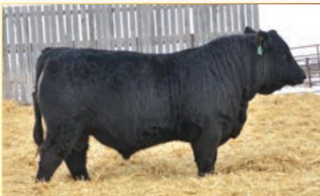
SCISSORS HEMISPHERE 2H | SERVICE SIRE

Safe to AI AI'd April 6, 2022 to Wheatland Monument 28H Exposed April 29, 2022- June 4, 2022 to Scissors Hemisphere 2H