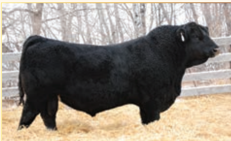
SPRINGCREEK TESLA 6E | SIRE

AI bred Apr. 13, 2022 to LRPS 5015C Exposed to Peak Dot Proposition Apr. 16, 2022 to May 10, 2022 Vet opinion safe to AI date