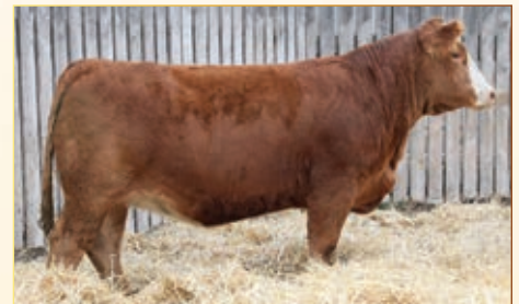
JPCC CHLOE 55G | DAM