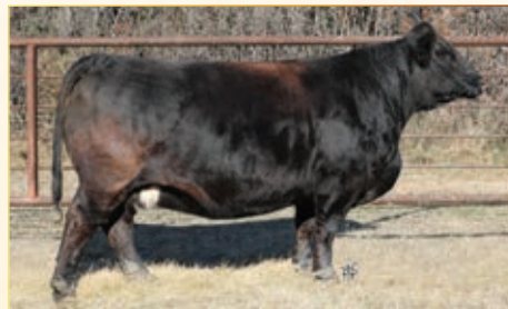
JLP 29B | DONOR COW