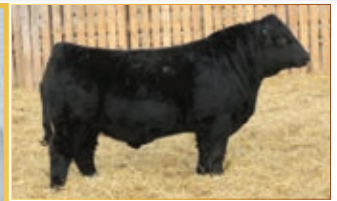
R PLUS 5015C | SERVICE SIRE to lots 32 & 33

AI'd to 5015C Apr. 13, 2022 Exposed to Peak Dot Proposition Apr. 16, 2022 to May 10, 2022 Vet opinion safe to AI date